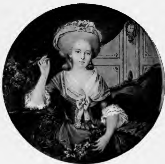
LA PRINCESSE DE LAMBALLE (Ob. 1792) BY P. A. HALL